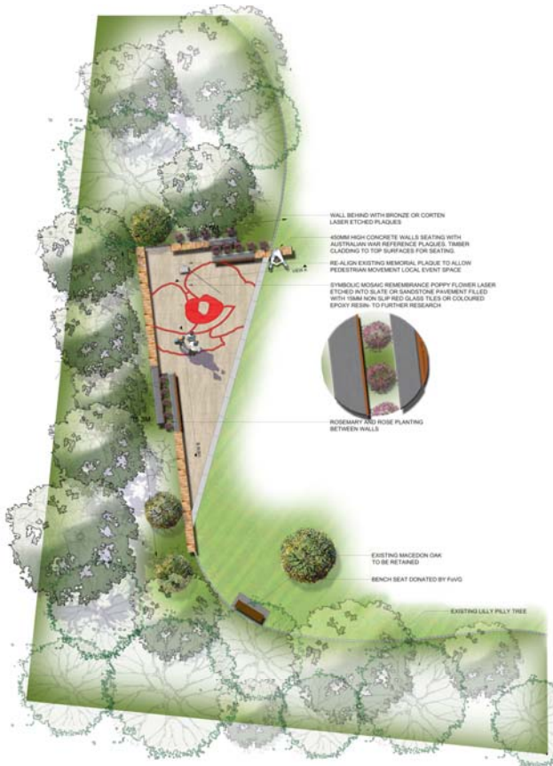
Victoria Gardens RSL War Memorial Concept Plan 1:100 @ A3